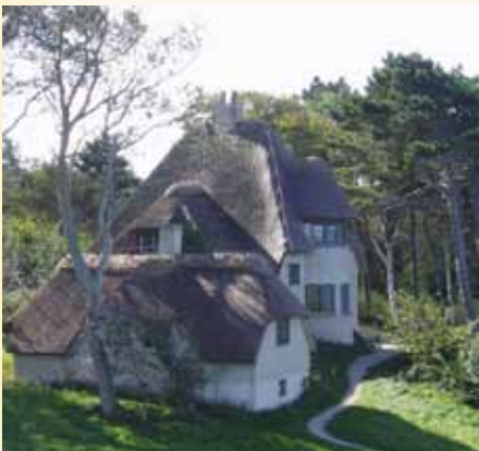
The famous Greenlandic polar explorer Knud Rasmussen's House at Hundested.

Still the town retains its old-fashioned charm with cozy little restaurants offering a variety of fresh fish and seafood, and small shops where personal service and a friendly chat with customers are deeply integrated in the local lifestyle. The special light from “the three waters” that surround Hundested has attracted many artists and you will find several art studios representing all sorts of “-isms” in and around the town.