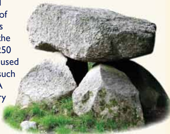
Barrow with burial chamber from the Bronze Age.

All day long there is regular train service directly from Hundested Harbour taking you to the center of Hillerød, the capital of North Zealand. The trip takes just half an hour. Here you will find everything to delight the shopper: old, new, modern, antiques – you name it!