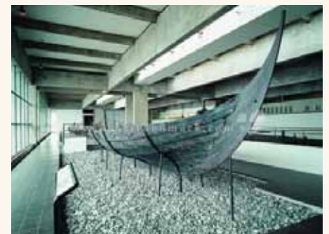
The Viking Ship Museum at Roskilde.

Every summer open-air performances tell the story of Viking life including fierce sword fights, lure playing and mead drinking. Further down south in Roskilde you will see the Viking Ship Museum displaying 5 Viking long-boats – sunk more than 1000 years ago in Roskilde Fjord. Visiting Roskilde naturally includes a visit to Roskilde Cathedral with the tombs of most of the Danish kings and queens.